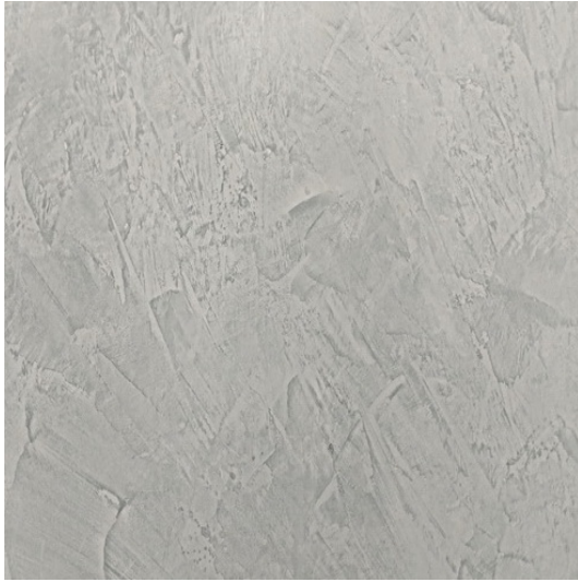
Lime paint roll, brush and trowel polished and waxed