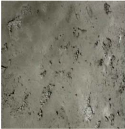
Intonachino lime plaster simulating concrete with pitting