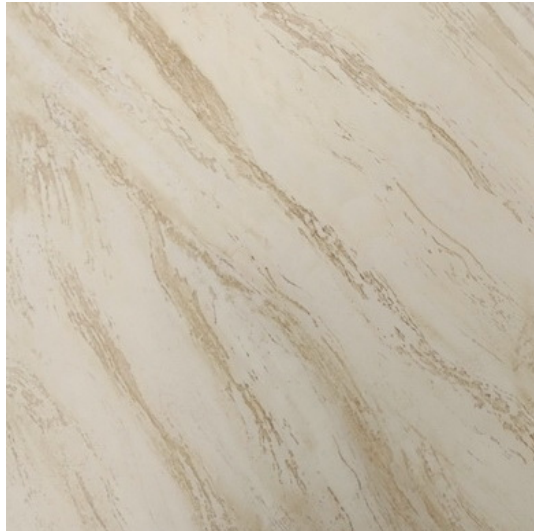
Vesuvio diagonal texture trowelled and glazed