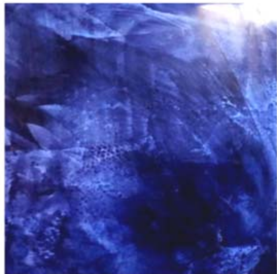
Super Lucido Marmorino mirror finish with Aquawax