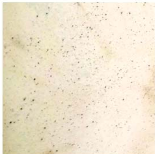
Puntinato using Carrera with colored sand plus classic Marmorino