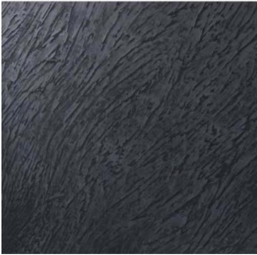
Black Carrara texture overlaid with classic and burnished with wax