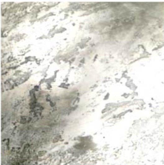
Vesuvio lime plaster pitted with silver patina finish