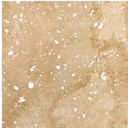
Calcite with Luci flakes trowel finish