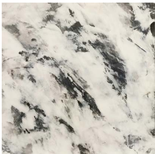
Marble finish with classic and Lucido multi tone polished and waxed

We may change a finish to accommodate class individual requests on the day