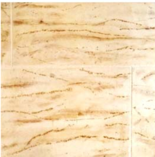
Roma Travertino with marbling by Colored waxes