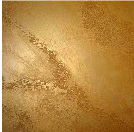
Metallic Marmorino gold with patina umber