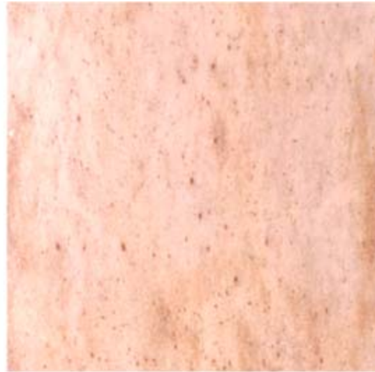
Coccio pesto or terra-cotta using Carrera plus classic Marmorino